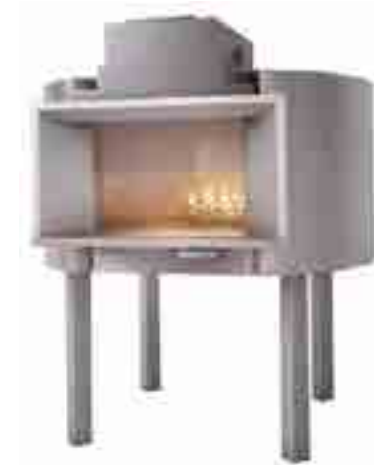
High performance fold down door model shown. High profile glass door design also available for selected Flametree series ovens.