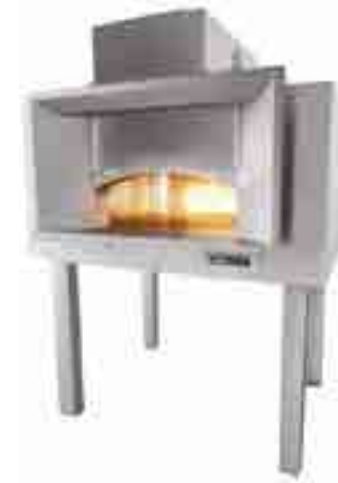
High performance fold down door model shown. High profile glass door design also available for selected Flametree series ovens.