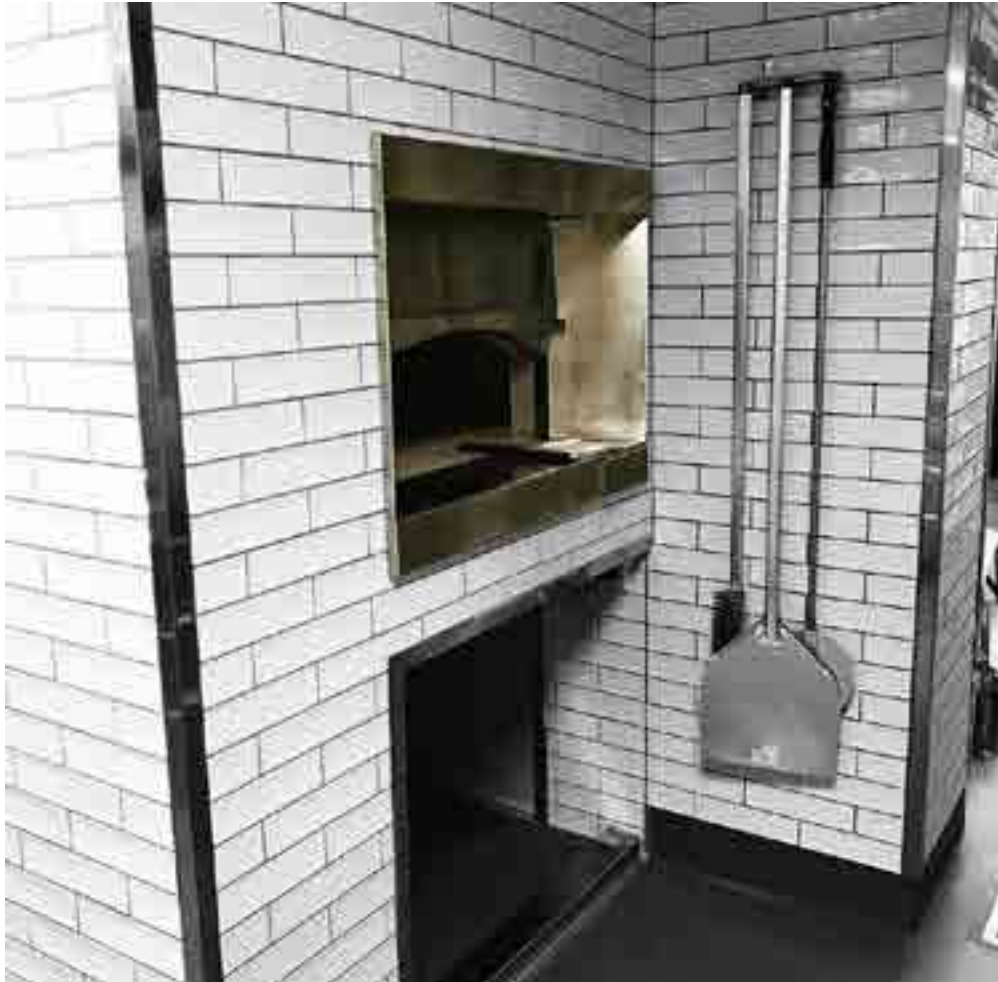
STATJIONEN NOORONA NORWAY