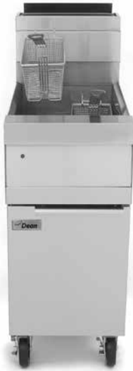
D150G Shown with optional casters.